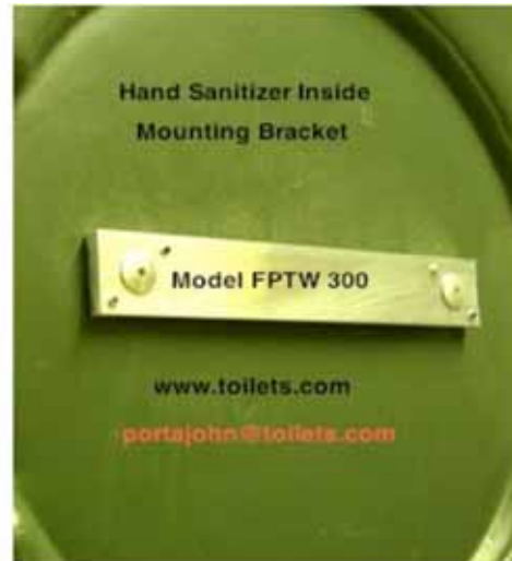
Externally Mounted Hand Sanitizer Dispenser Bracket