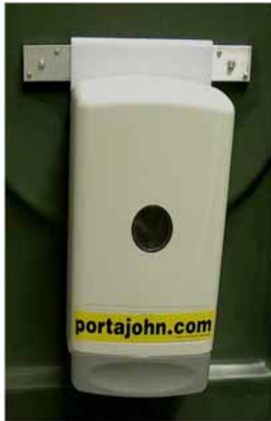
Externally Mounted Hand Sanitizer Dispenser