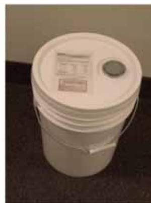
Porta John® Toilet Deodorizer 48 Hour Supply EMJ5GCH

DO NOT CONTAMINATE WATER, FEED OR FOOD ALWAYS KEEP CONTAINER CLOSED WHEN STORED MADE IN THE USA