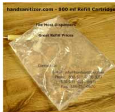
Alcohol Based Hand Sanitizer Refill