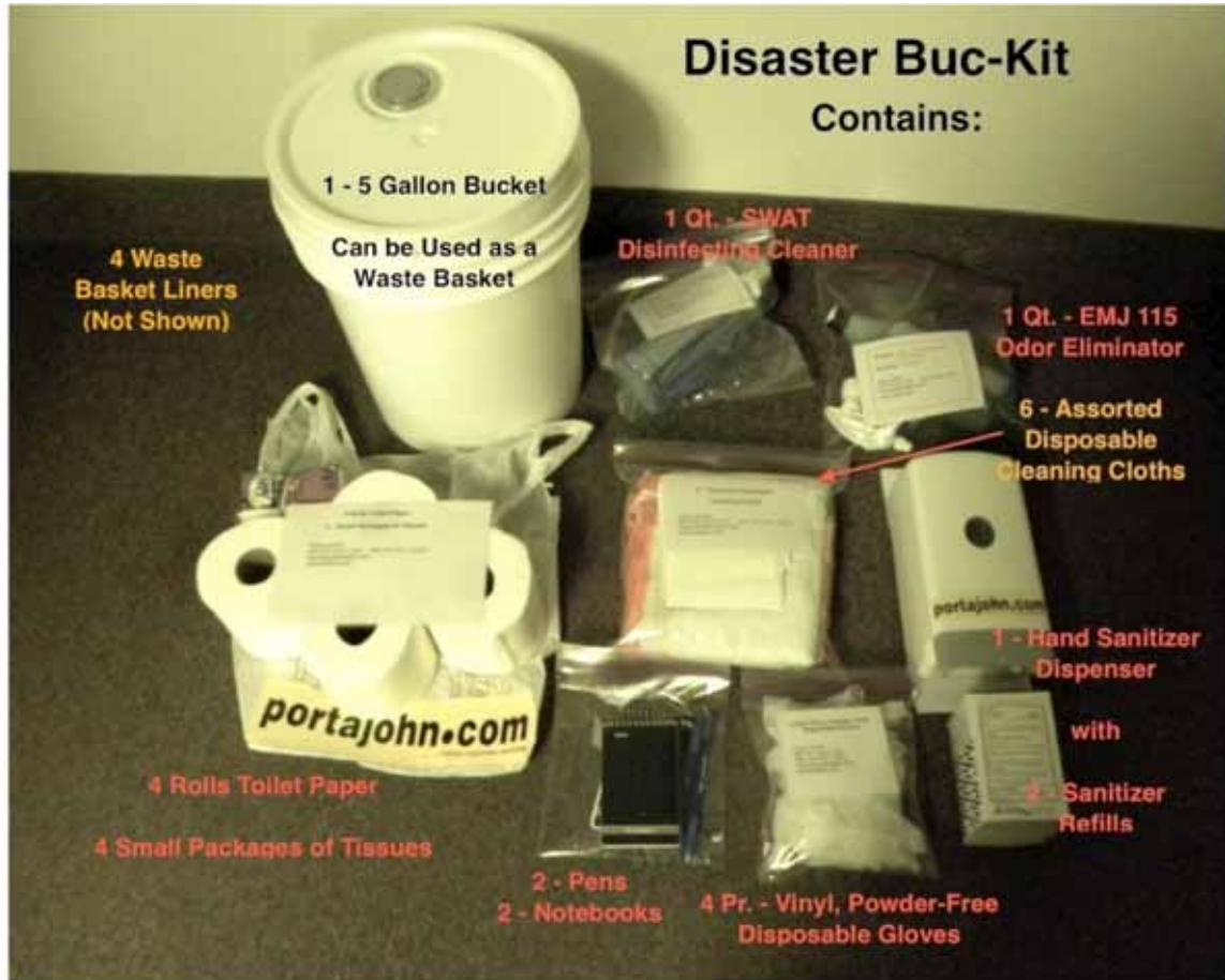
Illustration of the Contents of the Disaster Buc-Kit Shipped with the Model FPTW 300 Waterless Toilet