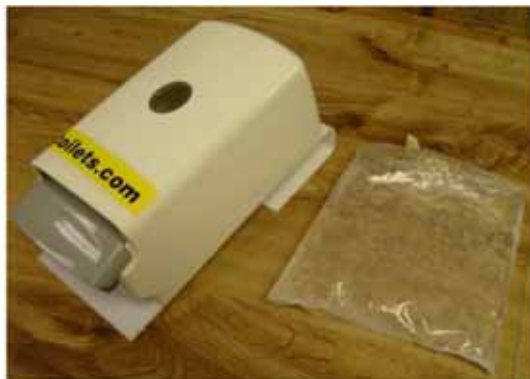
Hand Sanitizer Dispenser Ships with Refill Inside & a Second Refill in the Buc-Kit